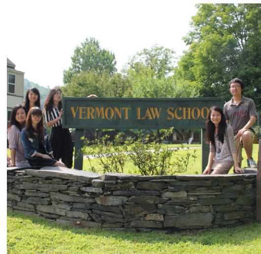
Visiting Chinese students at VLS this summer as part of the U.S.-China Student Collaborative Research Fellowship Program.