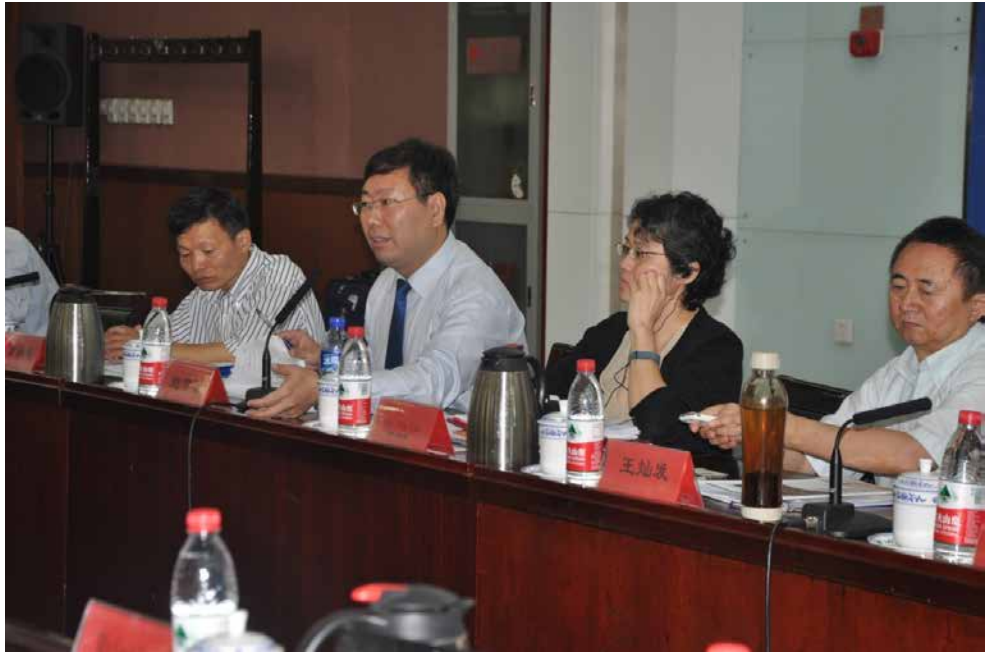
Environmental Justice Roundtable in Beijing