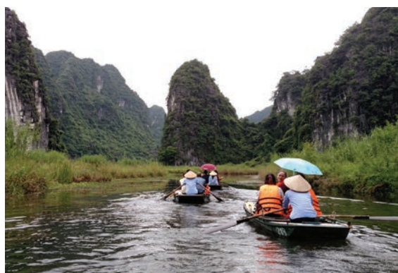
VLS students take a boat tour of Trang An, a UNESCO World Heritage site in Vietnam.