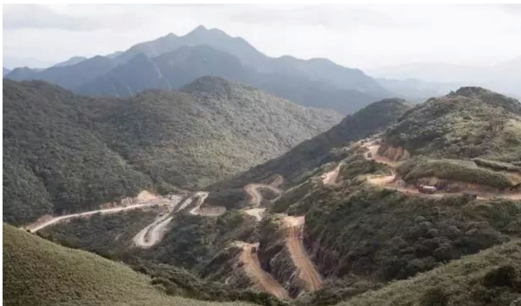
This illegally constructed road in Nanling National Nature Reserve will be restored according to the settlement agreement.