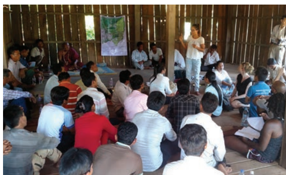
VLS students observe a collaborative resources management meeting in a local Cambodian village.