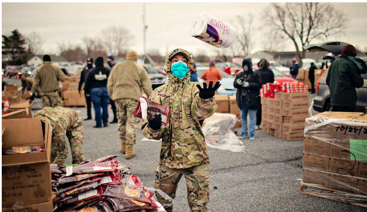
“Delaware National Guard” by The National Guard is licensed under CC BY 2.0 .

However, the term food security can be limiting when positioned as an ultimate goal, rather than one of many desired outcomes, because it does not adequately address the nutritional or diet quality of available foods or any of the root cause structural issues that create inequities and food insecurity in the first place. While food security is a helpful indicator of progress towards a more equitable food system, it is one step towards food justice, food sovereignty, and an end to food apartheid.