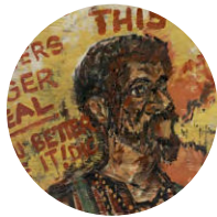
Hunger’s Wall: Tell It Like It Is