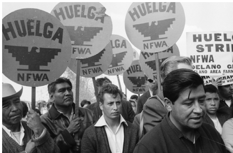
"Cesar Chavez walking with farmworkers carrying strike signs,"

* The examples above are a few selected examples of related resources and do not represent the full breadth of work on these issues.