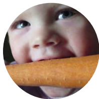
Hunger Through My Lens