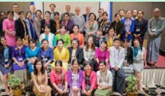
A family photo of the 28 professors from Myanmar's fourteen law faculties who attended the week-long "teach the teacher" environmental law course in Yangon in March 2018.

As a result of teaching this VLS course and leading the service learning project, I have become an advisor to the Myanmar delegation. This relationship has led to me conducting workshops supported by the UN Development Programme (UNDP) and UN Environment (UNEP) in 2017 and 2018, as well as one supported by the International Union for the Conservation of Nature (IUCN) and the Asia Development Bank (ADB). The former have continued to focus on building Myanmar's capacity to engage at the climate change negotiations and to streamline this international law and policy into their domestic climate change practices. The latter reached deeper into the environmental rule of law pipeline, to the law professors currently teaching the next generation of environmental law leaders in Myanmar. This work complements my teaching and helps bring contemporary practice of international climate change law into the classroom.