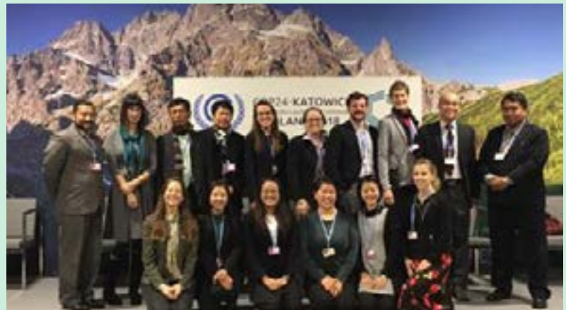
The family photo of the VLS COP24 Observer Delegation second-week team with the Myanmar State Party Delegation after a briefing session.