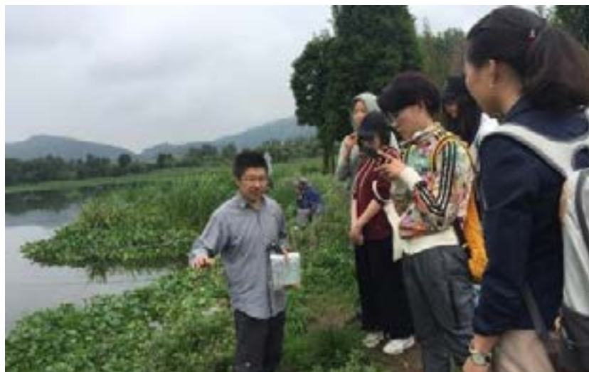
Environmental mission scholars conduct a field visit to Dianchi Lake.