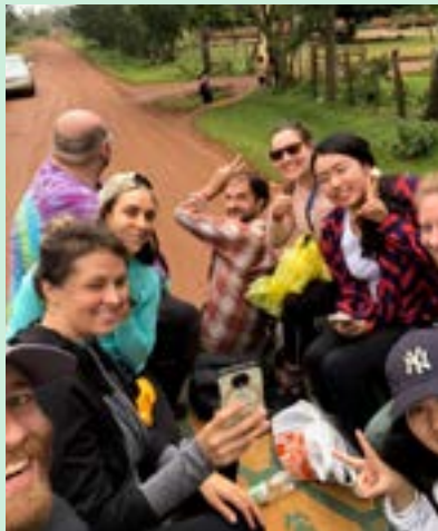
While in the Dak Dam community, we received a tour of the area via logging tractors.

When it comes to the optional two-week field study trip in Southeast Asia, I cannot stress how valuable the opportunity is. This year, the trip began in Phnom Penh, Cambodia and ended in Yangon, Myanmar. While in Cambodia, we first met with the Vishnu Law Group and attended presentations on their work on behalf of indigenous communities in the Monduliri and