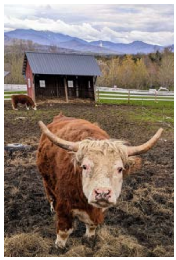
Pictured: Ben and Jerry, two mini steers rescued from an Oklahoma kill pen in February 2021.