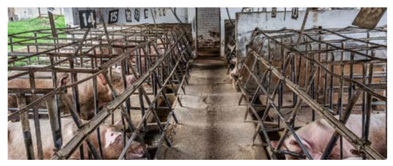
Pictured: Mother pigs in gestation crates, extreme confinment devices now banned in many states like California

In a momentous decision, the United States Supreme Court has upheld the Ninth Circuit's dismissal of National Pork Producers Council v. Ross, a case that challenged California's Proposition 12. This proposition ensures that pigs raised for products sold within the state have the freedom to lie down, stand up, turn around, and fully extend their limbs.